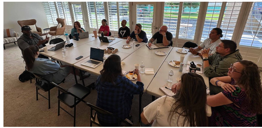
LODGEGRASS, MONTANA - Crown team members conducted a Restoration Path training with leaders of the Mountain Shadow Community Center and are working to create a new contextualized story for the Crow Nation community.