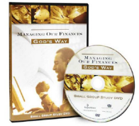
Managing Our Finances God's Way