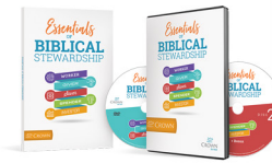
Essentials of Biblical Stewardship