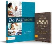
Do Well Biblical Financial Study