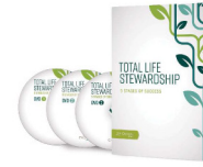
Total Life Stewardship