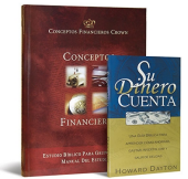
Estudio Biblico Conceptos Financieros