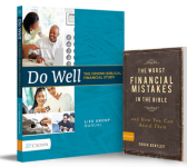
Do Well Biblical Financial Study