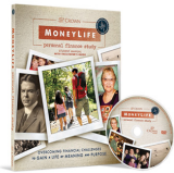
MoneyLife® Personal Finance Study

Crown offers a variety of resources to meet the needs of your congregation or organization.