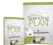
Creating a Spending Plan